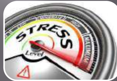
Hx of adustment disorder