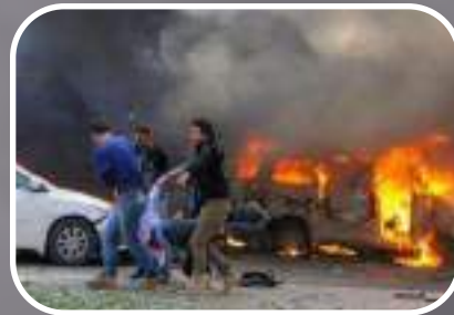
Man- made events