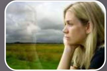
Dissociation around the event#