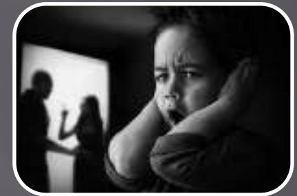
Adverse Early life