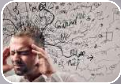
Hx Anxiety and Depression